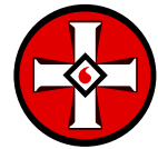
Ku Klux Klan (white supremacist)