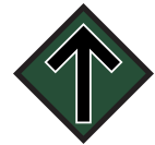
Nordic Resistance Movement (neo-nazi)