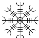
Helm of Awe (volkisch pagan)