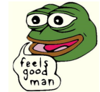
Pepe the Frog (alt-right)