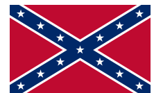
Confederate Flag (white supremacist)