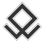
Odal Rune (Nazi/volkisch pagan)