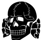
Death's Head (Nazi)