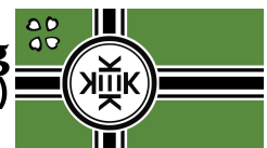
Kekistan Flag (alt-right)